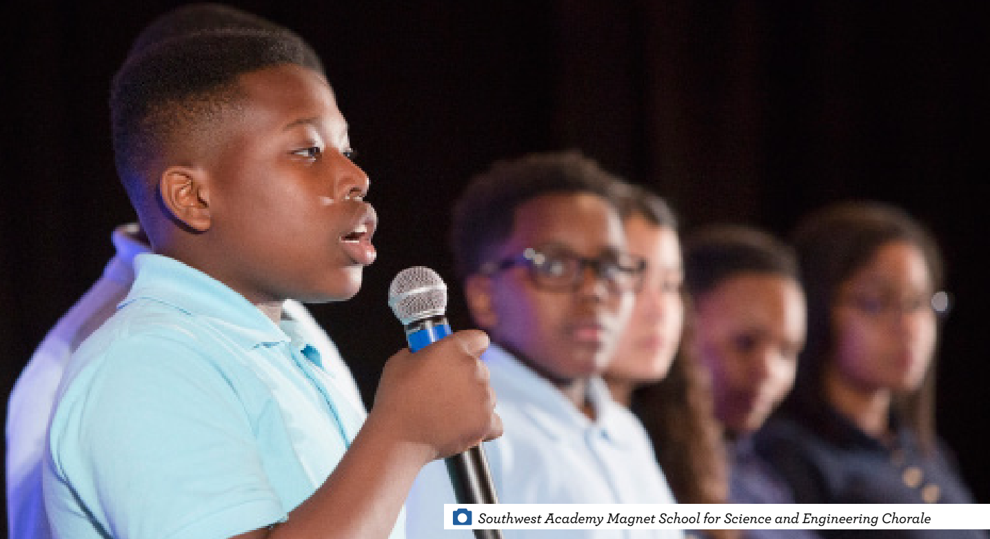
Southwest Academy Magnet School for Science and Engineering Chorale