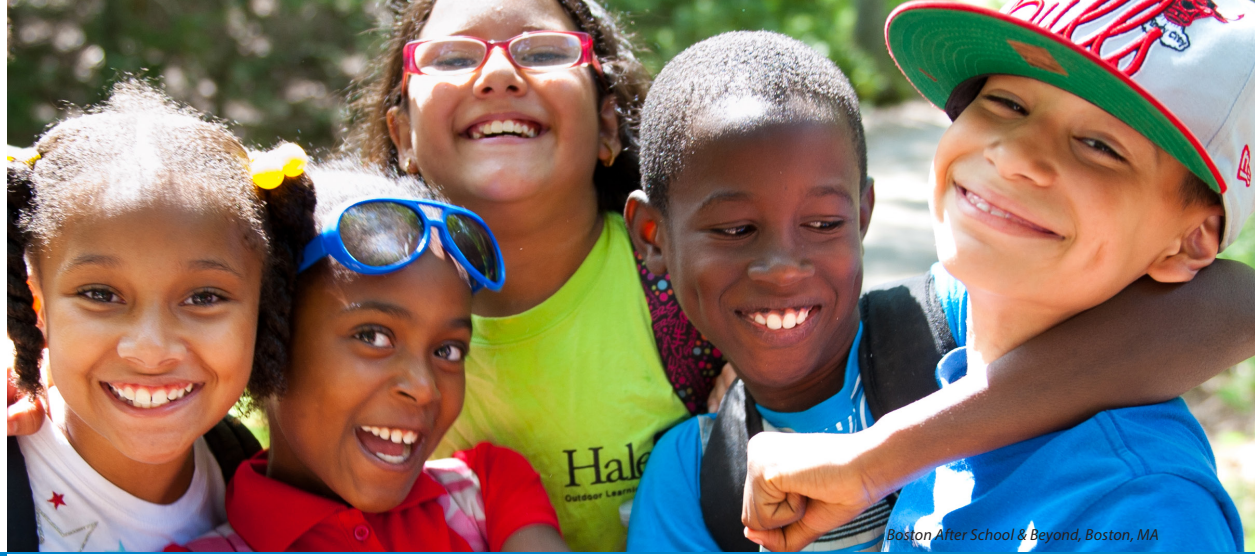
Boston After School & Beyond, Boston, MA

The Research in Brief allows researchers to reflect on their work and share the results with you.